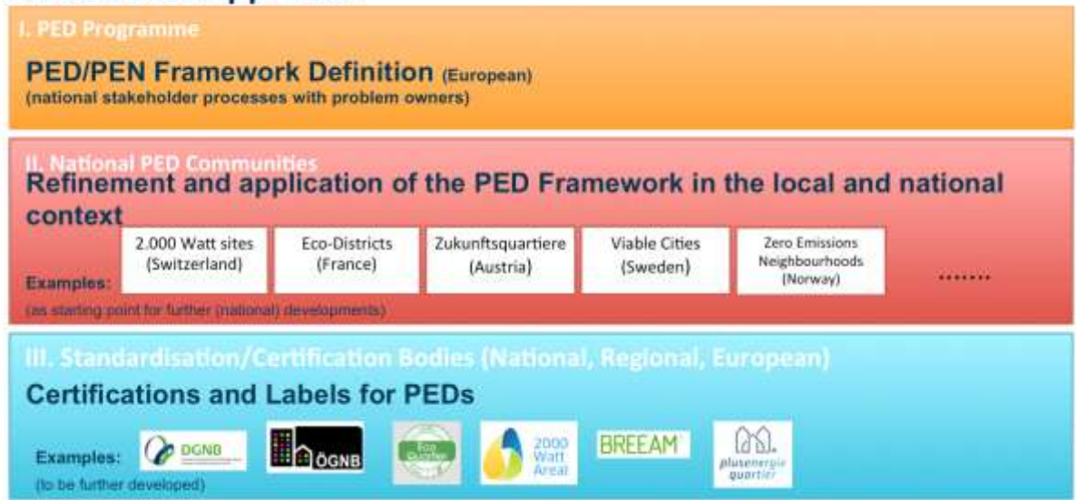
Figure 2: Three-level approach towards the application of the PED Framework