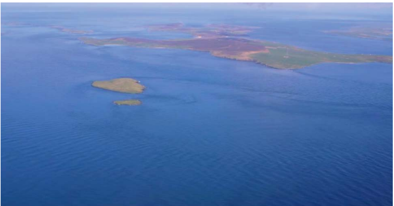
Aerial view of Fall of Warness, EMEC tidal test site

Tidal and wave energy solutions are often overshadowed by offshore wind, which attracts the lion's share of the publicity generated by renewable energy. Nevertheless, wave and tidal energy has seen some progress and, as the EMEC project clearly illustrates, these technologies are attracting the interest of major industrial companies, thereby improving the credibility of the sector and making it a truly commercial proposition. The company's clients include Europe's E.ON, Vattenfall and Voith Hydro, along with international giants such as Kawasaki Heavy Industries.