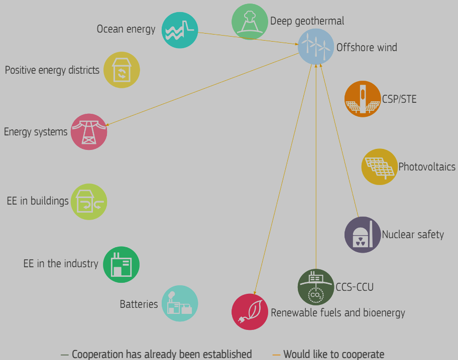
Figure 3 Collaboration with the IWGs

The Implementation Working Group is collaborating with the International Energy Agency (IEA).