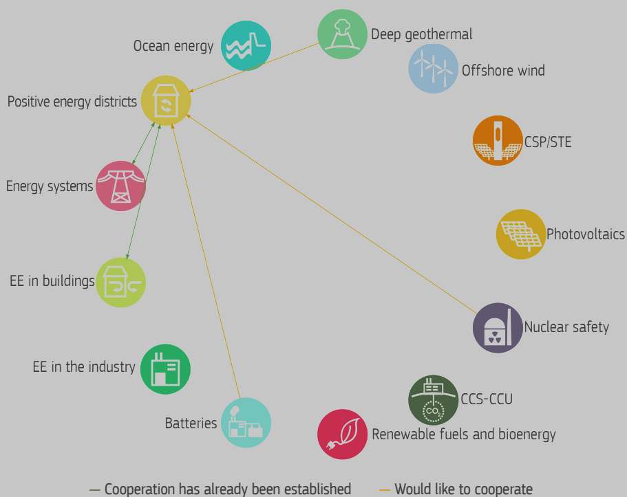
Figure 3 Collaboration with the IWGs

The IWG is involved in international research & innovation funding cooperation initiatives, such as the International Energy Agency (IEA) and Mission Innovation, to share and replicate the programme results. The PED programme will finally become one of the innovation pillars of the new cofunded partnership “Driving urban transitions towards sustainable solutions” under the Horizon Europe Programme.