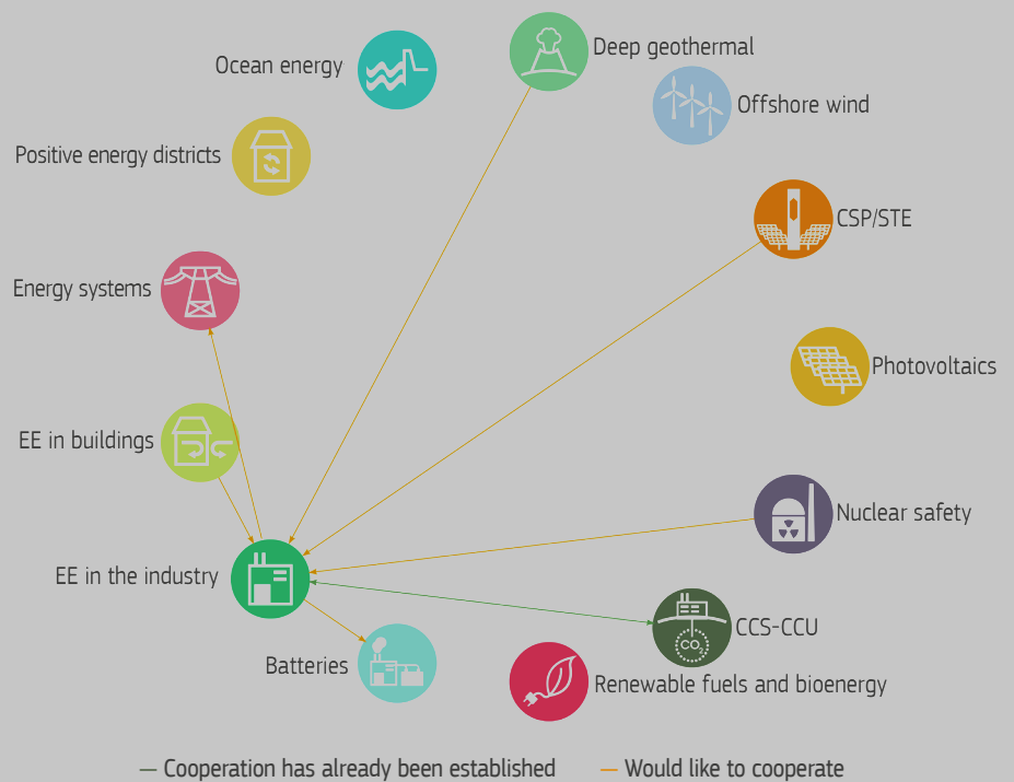
Figure 3 Collaboration with the IWGs

All Implementation Working Groups want to establish cooperation with the Energy systems Implementation Working Group. The work of this IWG is fundamental to deliver on the ambition of the European Green Deal and of the system integration strategy, through: