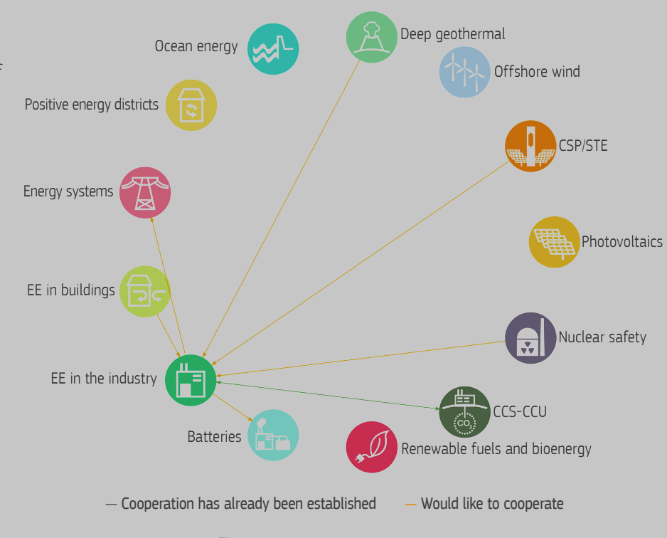
Figure 3 Collaboration with the IWGs

All Implementation Working Groups want to establish cooperation with the Energy systems Implementation